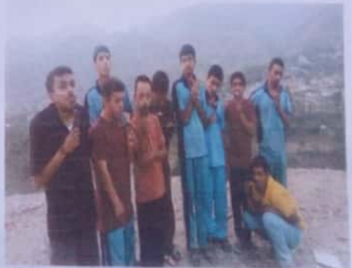
During Local Outing with CWSN